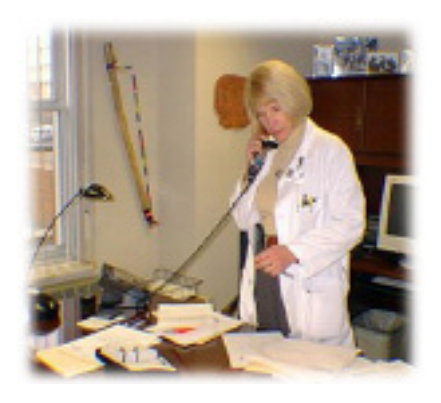
The attending nurse quickly notifies the attending physician of the neurologist's recommendation.