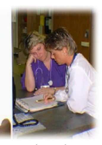
Next, the nurse obtains the patient's history.