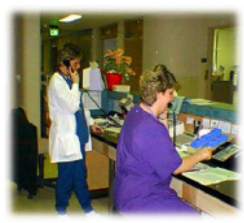
The SWAT nurse then notifies the on-call neurologist. Only 20 minutes have elapsed since the process began.