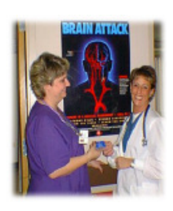
Nurse is congratulated for early identification of a stroke.