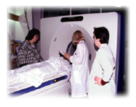
Patient receives a CT. Time elapsed: Only 40 minutes.